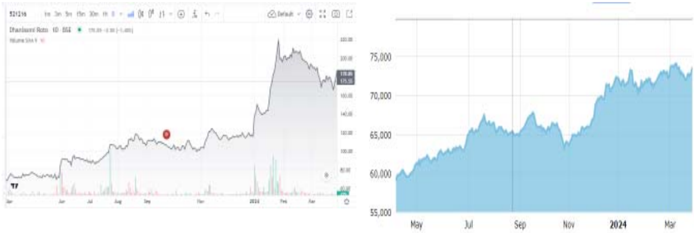
Dhanalaxmi Share Price